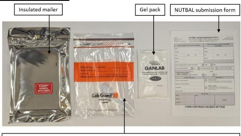
GAN Lab ziptop bag with pocket, containing one pair of disposable gloves, one disposable spoon and one ziptop bag.